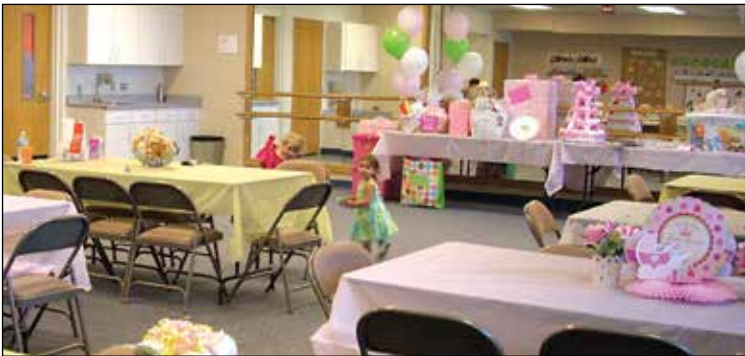
Multipurpose Room Rental

Please note a usage fee and maintenance deposit are required to insure the site is clean after use. There is a special rate for Village Residents if they would like to rent the "Kay Gnech" Multipurpose Room. The special rate is $150.00 for a five hour rental. The fee includes room setup and teardown.